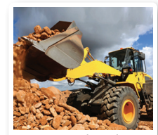
Front End Loader